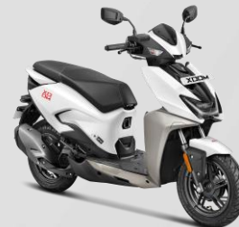
Pearl Silver White