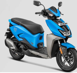
Pole Star Blue