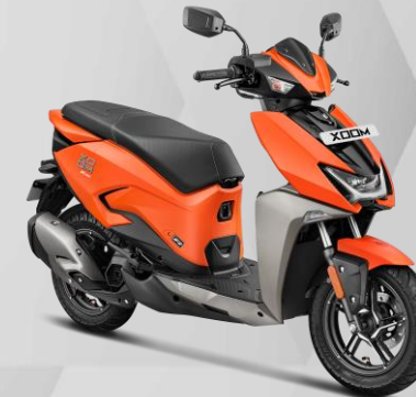
Matte Abrax Orange