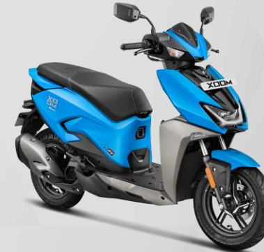
Pole Star Blue