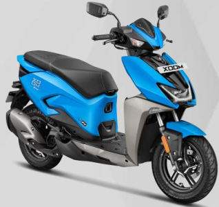
Pole Star Blue